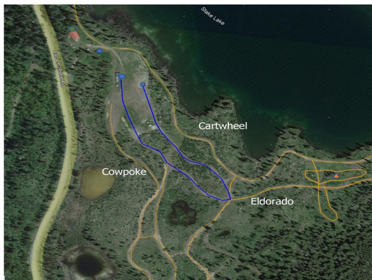
Overlander Ski Club 0.6km Course