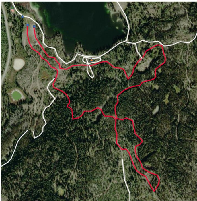
Overlander Ski Club 3.5 km