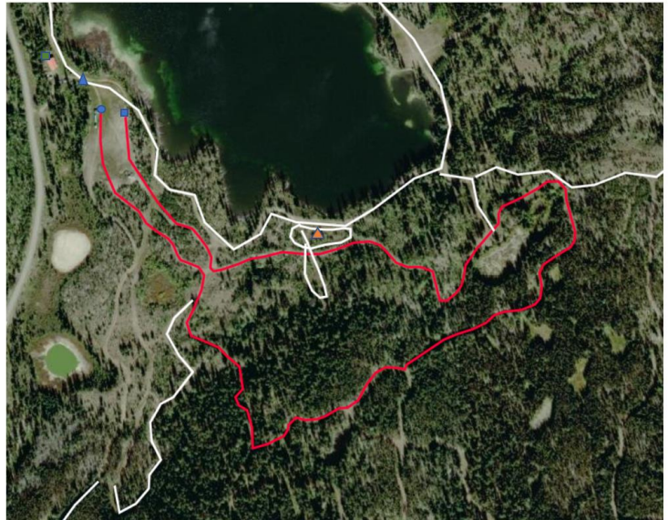
Overlander Ski Club 2.5 km