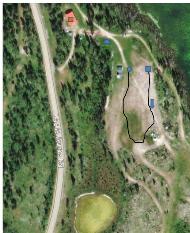
Overlander Ski Club - 300m Course